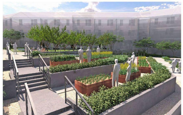
View of gardens and buildings looking SE

The Richmond Neighborhood Association is hosting this event to support our Peaceful Villa residents, to support affordable housing, and to share information with the greater community. Free childcare provided for children 2 years and over.