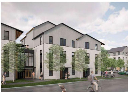
SE 47th Avenue looking NW

Home Forward is redeveloping the existing 70-unit Peaceful Villa affordable housing site with approximately 166 new apartments. The four-acre property is located between SE Clinton & Woodward, and 46-47th Ave. Proposed plan & images below.